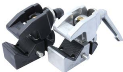
KCP-710 Convi Clamp w/Adjustable Handle-Silver