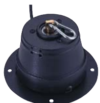
C8123 1-3RPM For 2"-12" Mirror Ball