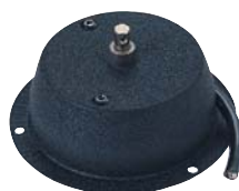
C8123H heavy duty motor For 14"-20" Mirror Ball